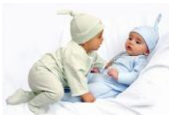
We are all born to connect

Many of today's young people have not experienced true attachment and belonging. Micro-nuclear families, domestic conflict, unfriendly preschools/schools, rejecting peers and antagonistic neighbours have all contributed to the sense of alienation and rejection felt by so many of our disconnected children and youth. Children estranged from positive, supportive adults and peers remain emotionally and (often) morally adrift.